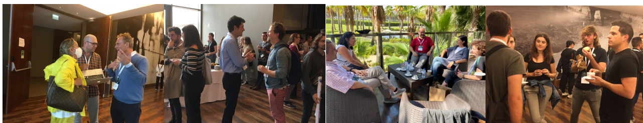
SEBD members enjoying the meeting and participating in the scientific discussions