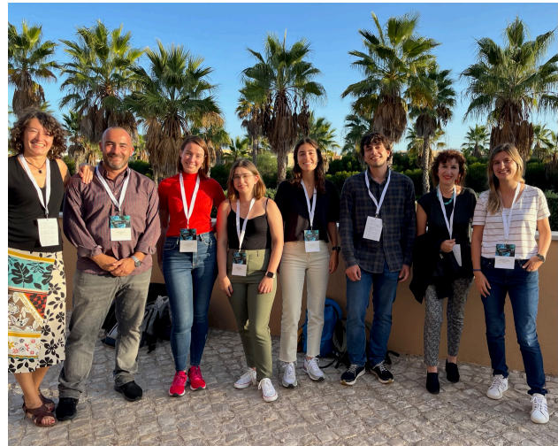
The grantees together with SEBD Board members